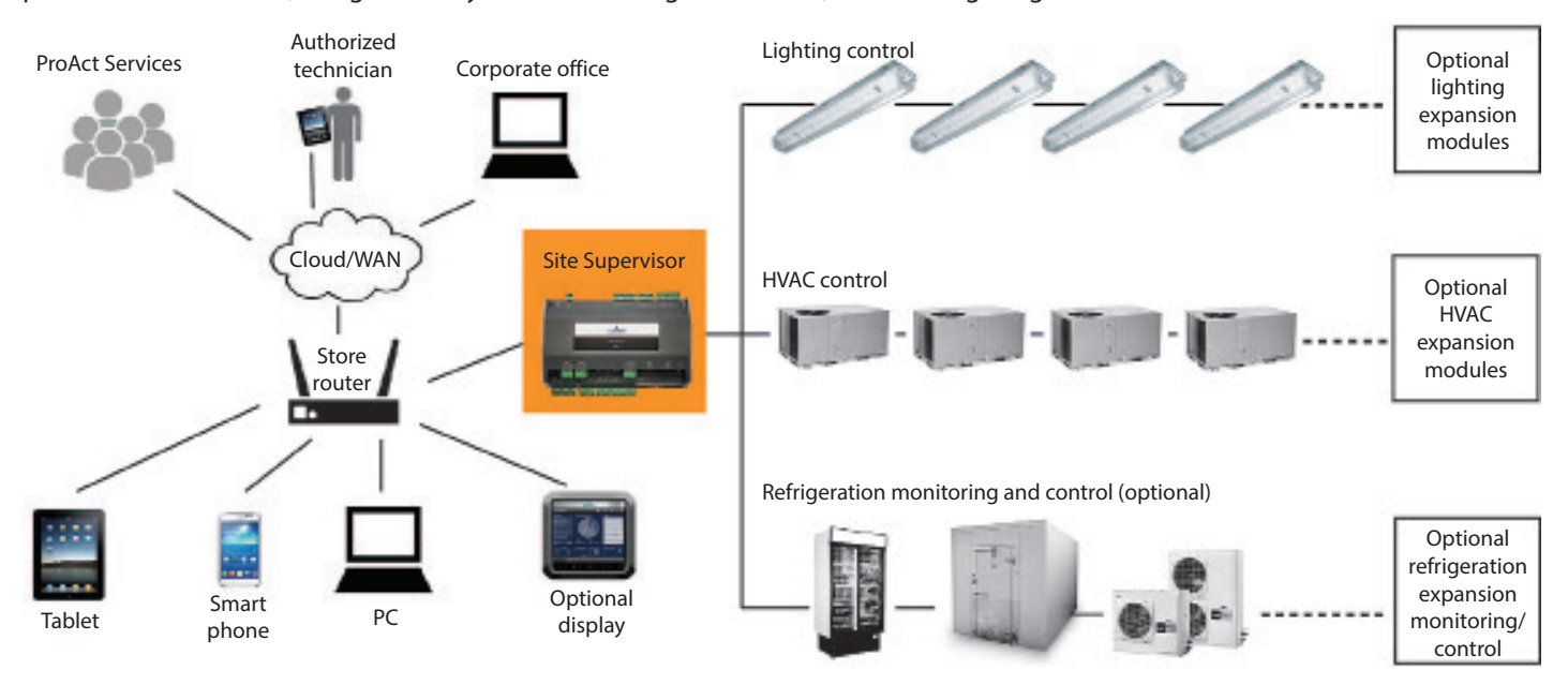
Site Supervisor connects with a number of 3rd party devices. For a complete list of these devices please visit EmersonClimate.com/RetailSolutions

The ecoSYS family is the next generation of facility controls that delivers energy management with the ability to monitor various facility systems and provides alerts when there are issues that need attention. The Site Supervisor control module provides HVAC control, refrigeration system monitoring and control, as well as lighting control.